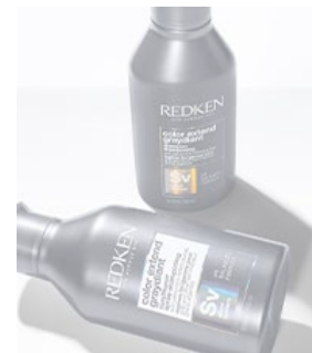
Color Extend Graydiant