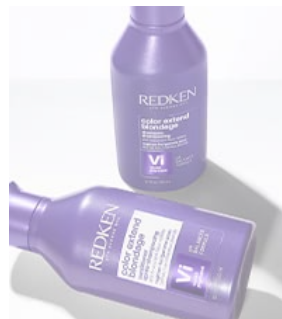
Color Extend Blondage