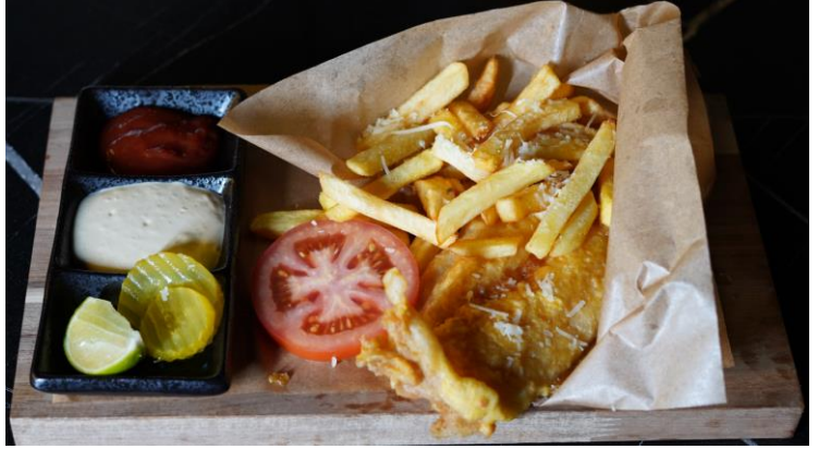
Classic Dolly Fish & Chips | FISH & CHIPS | ฟิชแอนด์ชิป AED 69

Char broil beef patties brioche bun burger with homemade smoked barbecue, lettuce, tomato, red onion, pickles and cheddar cheese served with French fries