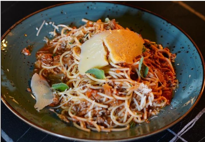
Spaghetti meats sauce | SPAGHETTI NUR | สปาเก็ตตี้ซอสเนื้อ AED 79

Grilled Australian rib eye with grilled or steamed vegetables and Café de Paris and French fries