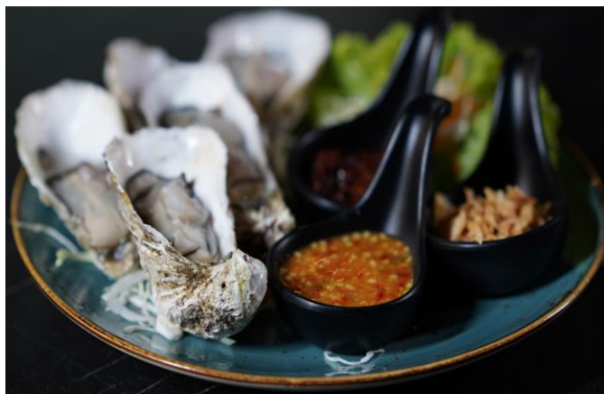
Oysters | HOI NAG ROM | หอยนางรมสด AED 119

Grilled marinated chicken breast served with signature peanuts coconut sauce