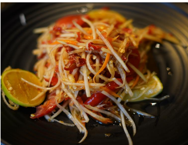
Papaya Anchovy Salad | SOM TAM PLA RA | ส้มตำไทยปลาร้า AED 59

Spicy minced chicken salad with shallot, onion, parsley and chili lemon sauce