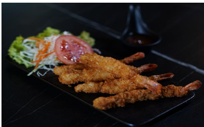
Shrimp Tempura | GOONG TEMPURA | เทมปุระ AED 69

5 pieces of fresh oysters served with crispy shallot and our signature spicy seafood sauce