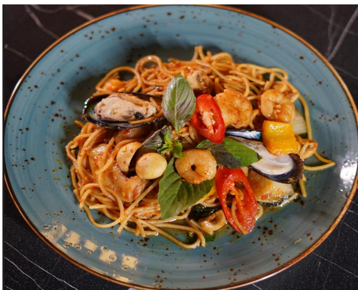
Wok spaghetti chili basil | SPAGHETTI KEE MAW | สปาเก็ตตี้ผัดขี้เมาทะเล AED 105

Veggies, seafood, a touch of chilies with a full of spaghetti (It's all seafood here!)