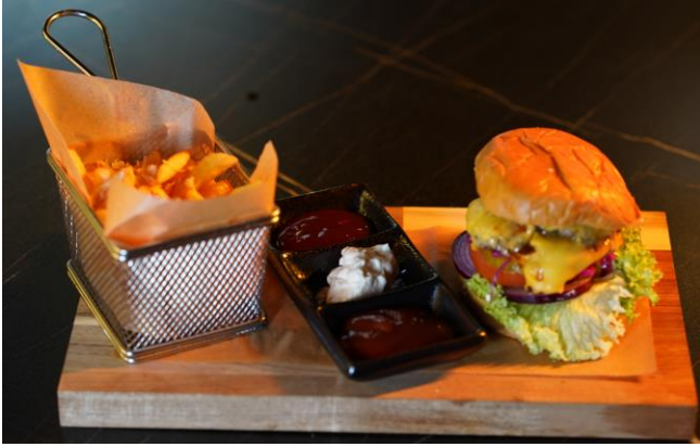
Barbecue Beef burger BURGER NUR | เบอร์เกอร์เนื้อ AED 59

Char broil beef patties brioche bun burger with homemade smoked barbecue, lettuce, tomato, red onion, pickles and cheddar cheese served with French fries