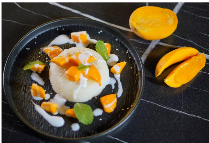
Mango sticky rice | KHAO NIEW MANOUNG | ข้าวเหนียวมะม่วง AED 59