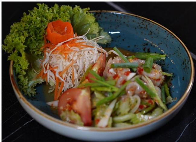
Raw Shrimp Salad Seafood sauce | YAM GOONG SOD | แซ่กุ้งสด AED 59

Spicy raw salmon salad with shallot, onion, mint leafs and chili lemon