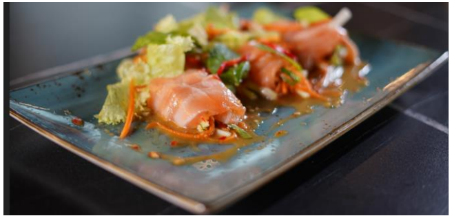
Spicy Salmon salad | LAB SALMON | แซ่ซ่าลมอลสด AED 69

Spicy raw salmon salad with shallot, onion, mint leafs and chili lemon