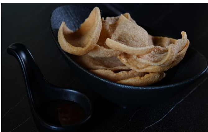
Prawns cracker | KHAO GREAB | ข้าวเกรียบ AED 10

Deep fried breaded coat shrimps served with soya sauce