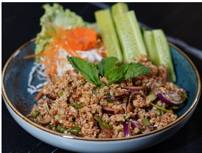
Chicken salad | LAB GAI | ลาบไก่ AED 59

Spicy minced chicken salad with shallot, onion, parsley and chili lemon sauce