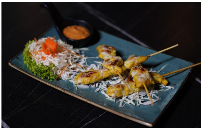
Chicken Satay | GAI SATAY | สัตถ์เต๊ะ AED 55

Grilled marinated chicken breast served with signature peanuts coconut sauce