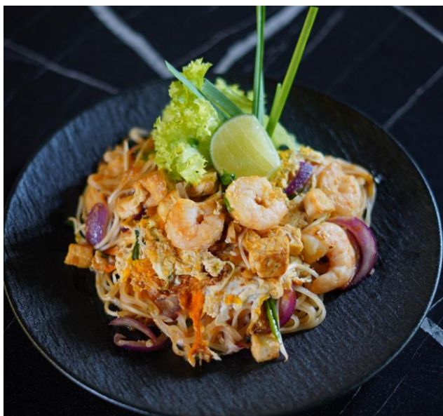
Wok Thai noodles | Phad Thai | ผัดไท AED 69

Wok fried rice noodle in tamarind favourite with chive