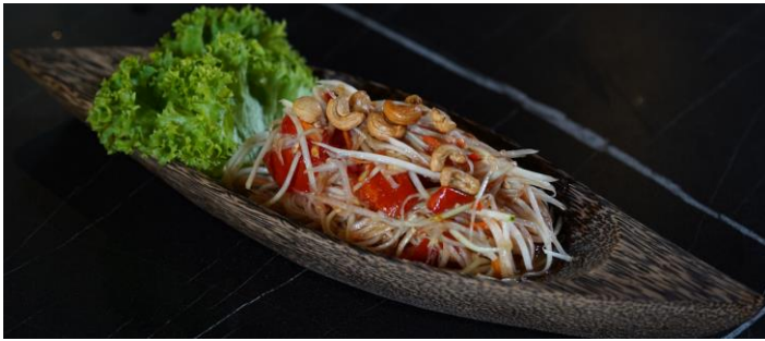
Thai Papaya Salad | SOM TAM THAI | ส้มตำ AED 59

Spicy marinated papaya salad with spicy chili lemon dressing