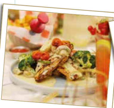
Chargrilled Chicken breast