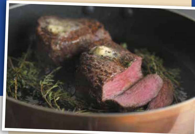
Aberdeen Angus Fillet Steak* 170g (6oz) Serves 1 WAS £11.04