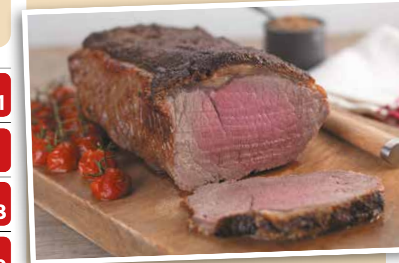
Scotch Beef Striploin 907g (2lb) Serves 4 WAS £29.89