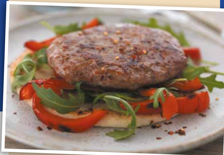
Pork & Chorizo Burger 170g (6oz)