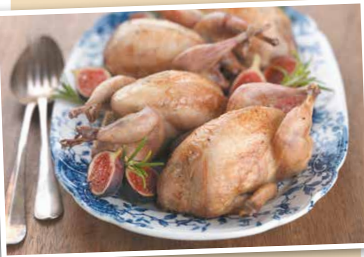
Jumbo Quail* 794g (1.7lb)