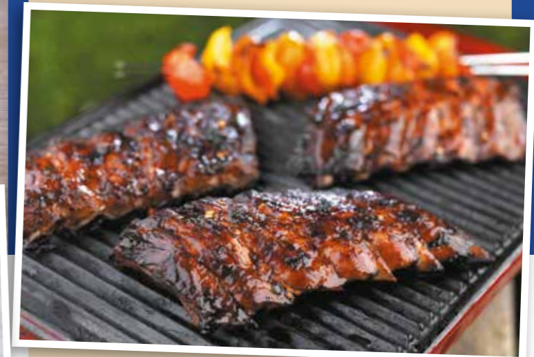
Baby Back Ribs* 400g (14.1oz)