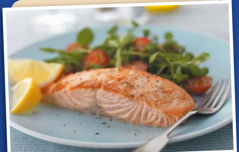
Salmon Fillet Skin On 85g (3oz)