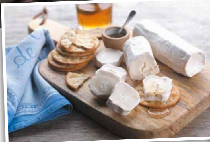
Mini Goats Log* (Above) 198g (6.9oz)