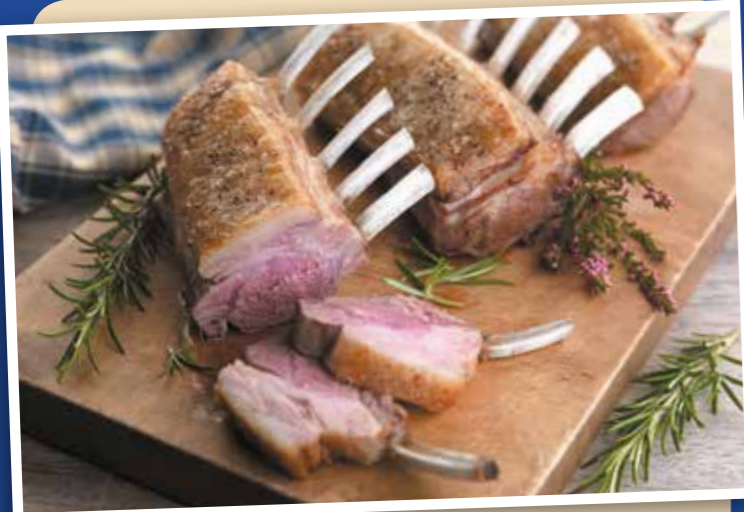
Rack of Scotch Lamb French Trim 340g (12oz) Serves 1