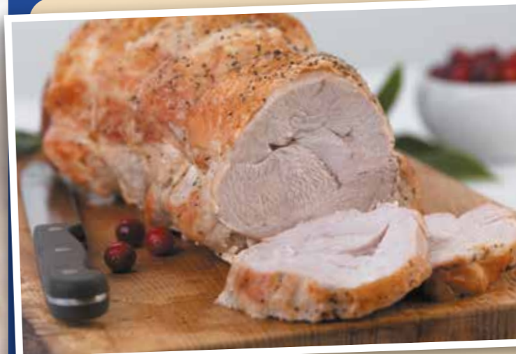
Turkey Breast Boneless* 907g (2lb) Serves 4 WAS £14.77