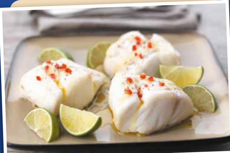
Cod Portion Skin On 113g (4oz)