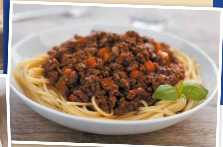
Scotch Beef Steak Mince 454g (1lb) Serves 2 WAS £3.15