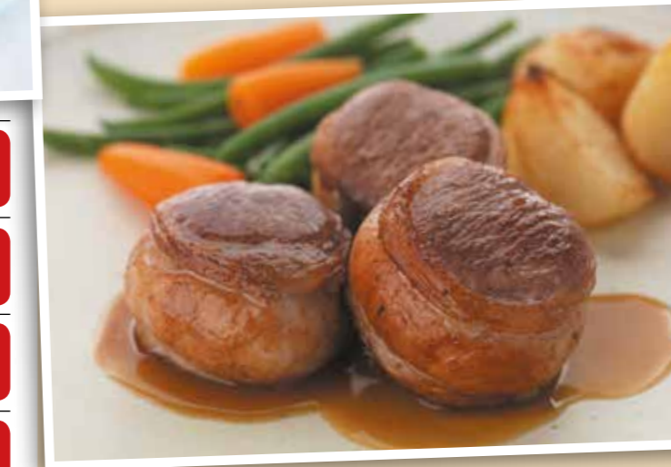
Scotch Lamb Noisette 57g (2oz) WAS £1.88