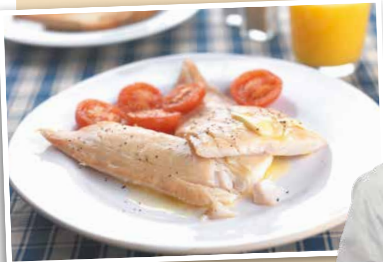
Smoked Haddock Fillet 227g (8oz)