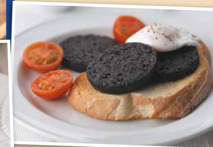
Campbells Black Pudding 454g (1lb)