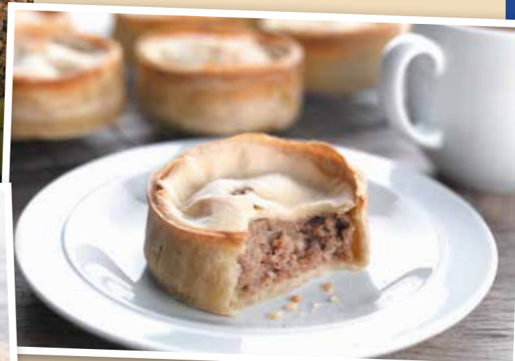
Scotch Pies Box of 12 1.8kg (4lb) WAS £9.10