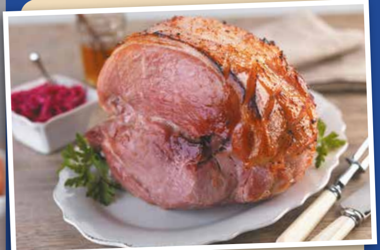
Gammon Boneless 907g (2lb) Serves 4 WAS £7.21