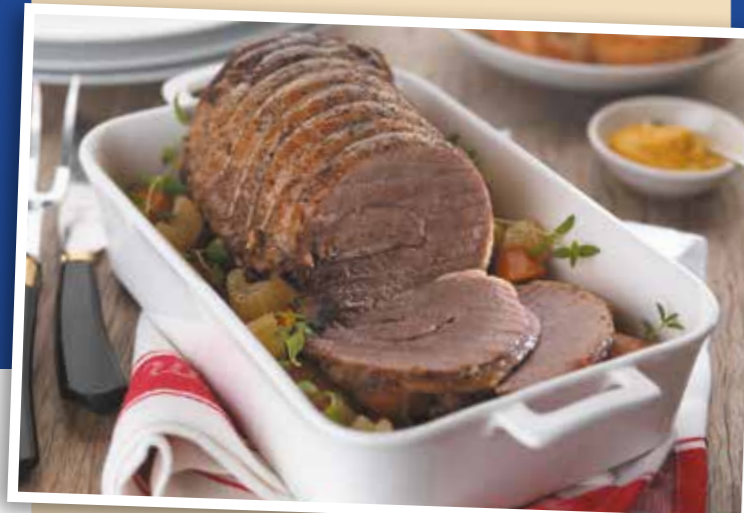
Scotch Beef Brisket Roasting Joint 680g (1.8lb) Serves 3-4 WAS £6.30