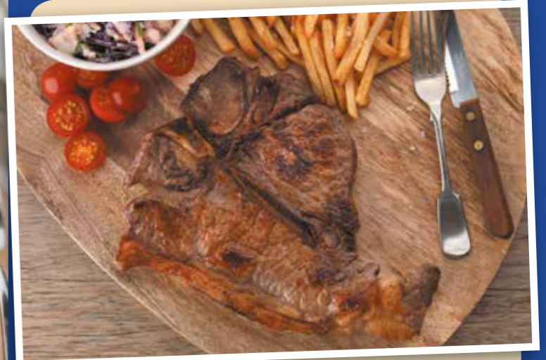
Scotch Beef T Bone Steak 369g (13oz) Serves 1