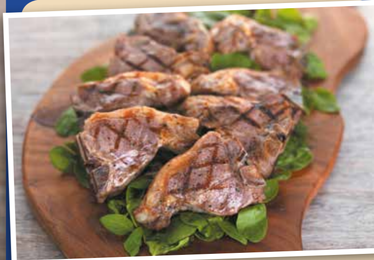
Scotch Lamb Chop 113g (4oz)