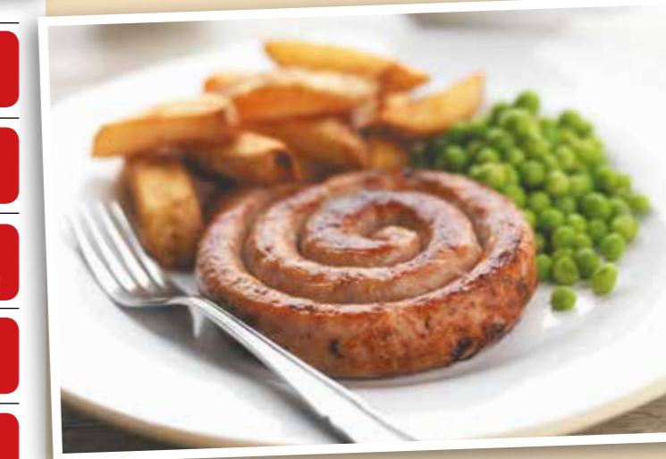
Cumberland Ring Sausage 227g (8oz)