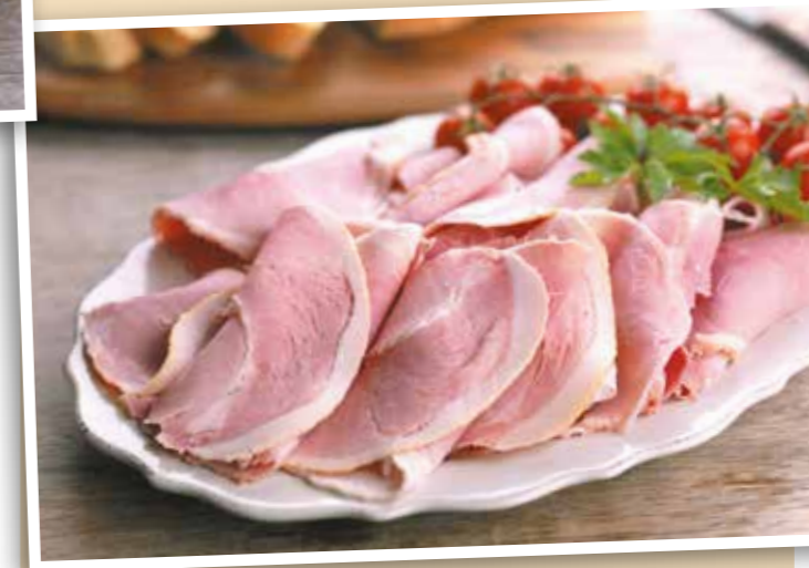
Honey Roast Ham Sliced 500g (17.6oz)