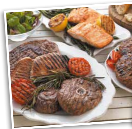
Special Packs – pages 18-19