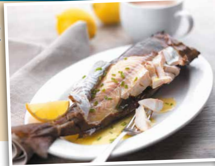
Arbroath Smokies (Above) 454g (1lb)