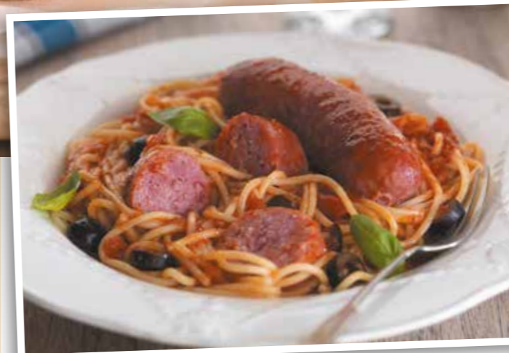
Salsiccia Italian Sausages* (Above) 450g (15.9oz)