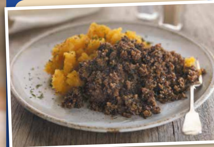
Campbells Haggis 454g (1lb) WAS £4.97