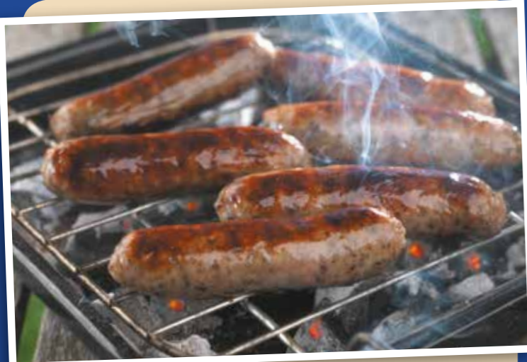
Pork Haggis & Herb Sausage 454g (1lb) WAS £2.95