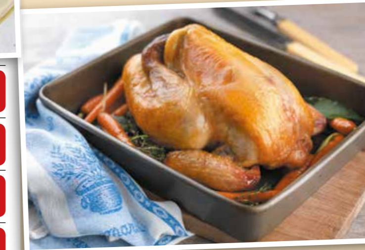
Guinea Fowl* 1.2kg (2.6lb)