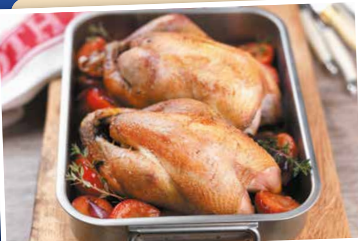
Whole Pheasant* 680g (1.5lb)