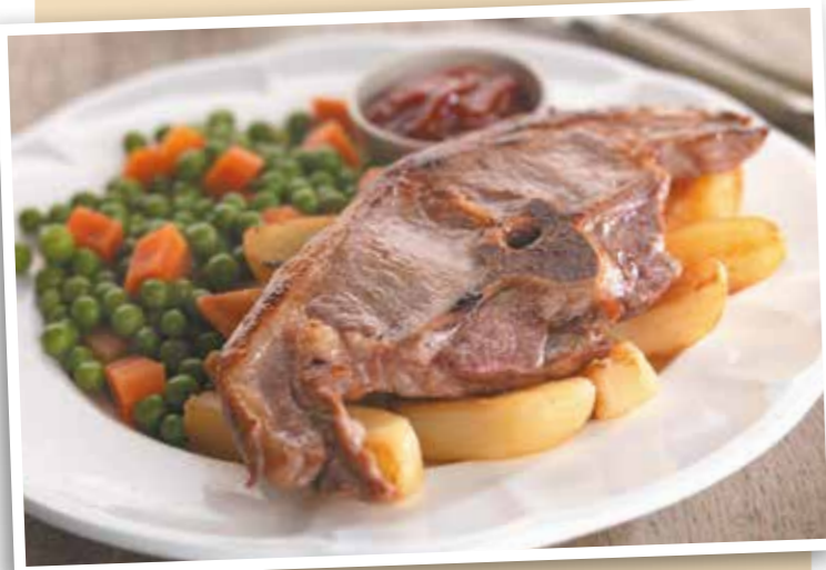
Scotch Lamb Barnsley Chop 170g (6oz) Serves 1