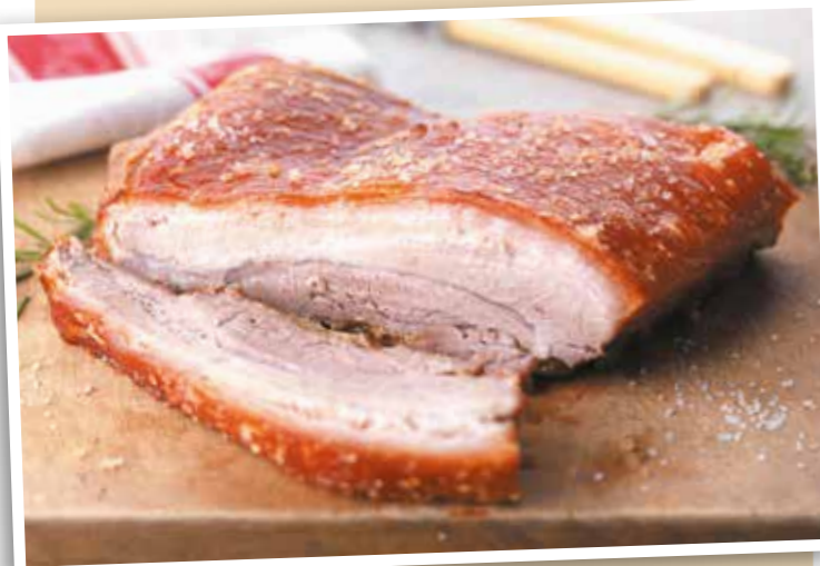
Scotch Pork Belly Finely Scored 907g (2lb) Serves 4