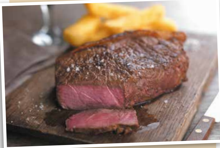
Aberdeen Angus Sirloin Steak* Special Trim 170g (6oz) Serves 1 WAS £5.91