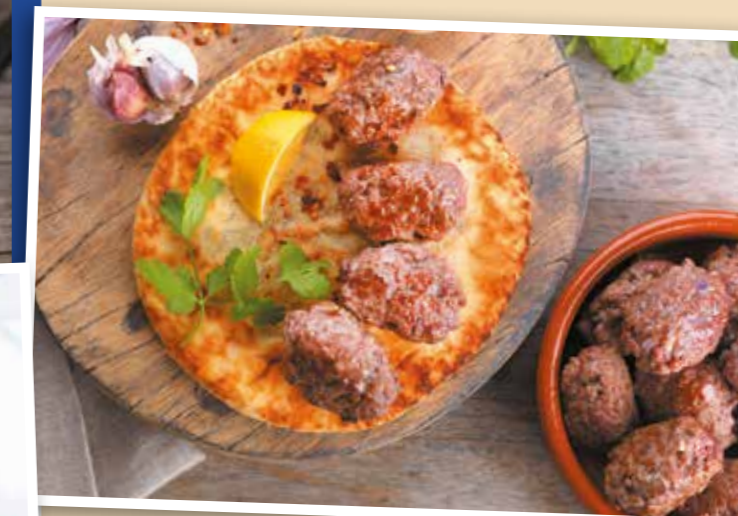
Scotch Lamb Leg Mince 454g (1lb) Serves 2 WAS £3.15