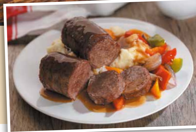
Beef Olives (Above) 170g (6oz)