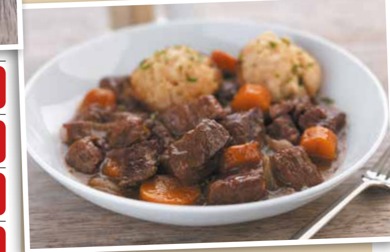
Hand Diced Scotch Beef Stewing Steak 454g (1lb) Serves 2 WAS £6.79