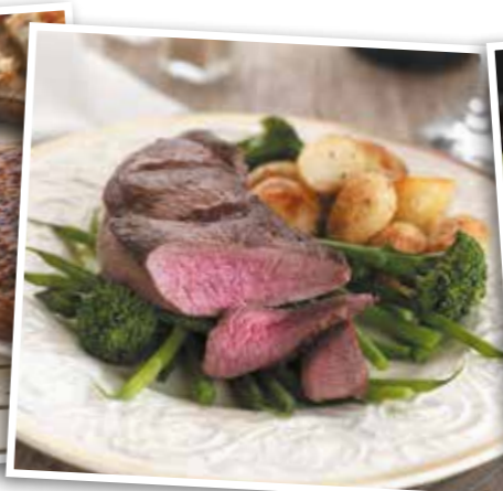
Game – page 20