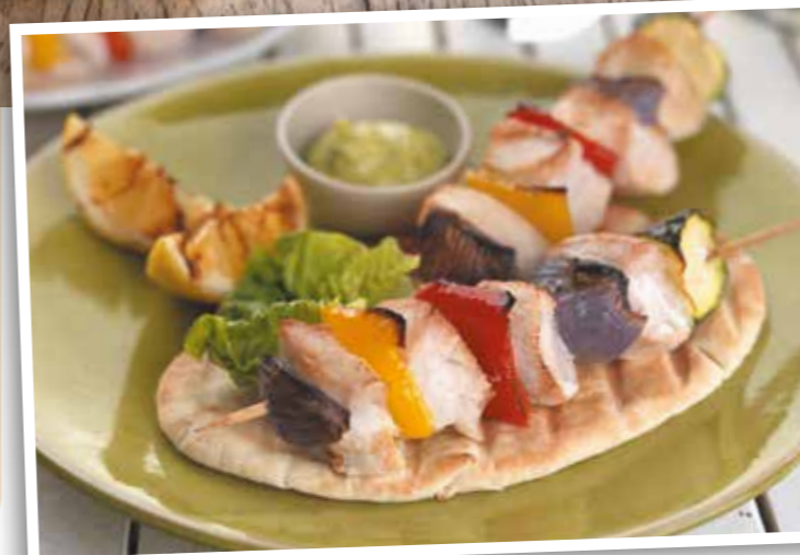
Diced Chicken Breast* (Above) 454g (1lb)