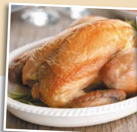
Poultry – pages 12-13