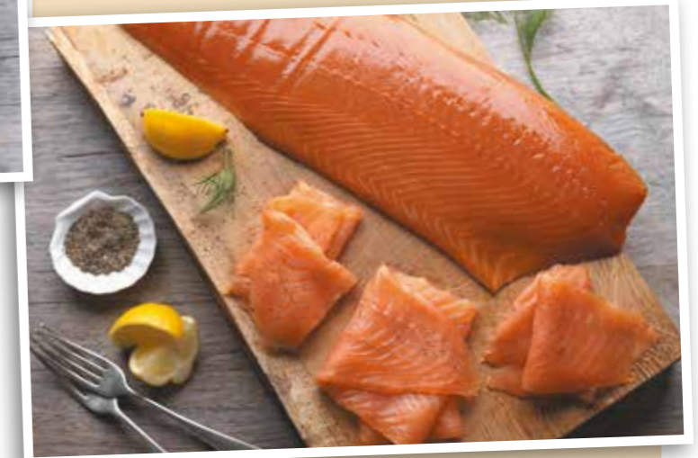
Martin Wishart Oak Smoked Salmon 800g (1.8lb)