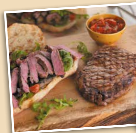
Scotch Beef – pages 4-7

Our fish is bought daily from Scottish markets then prepared by our skilled fishmongers. Our chicken has exceptional flavour and is from quality farms, and we also supply free-range chickens, turkey, duck, poussin and guinea fowl.