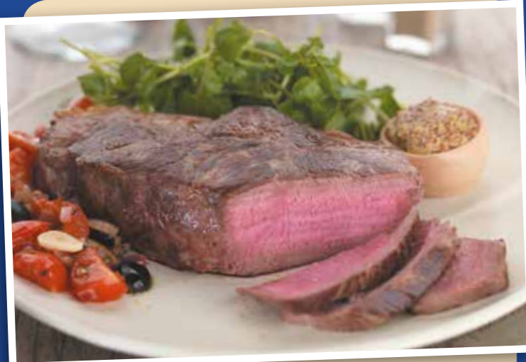
Scotch Beef Porterhouse Steak 198g (6.9oz) Serves 1 WAS £7.77