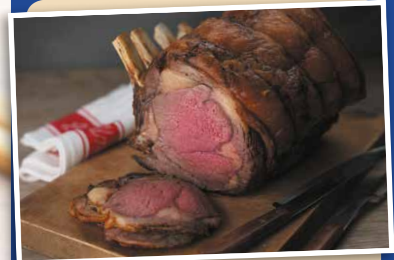
Scotch Beef Carvery Rib of Beef 2.5kg (5.5lb) Serves 6-7 WAS £44.86