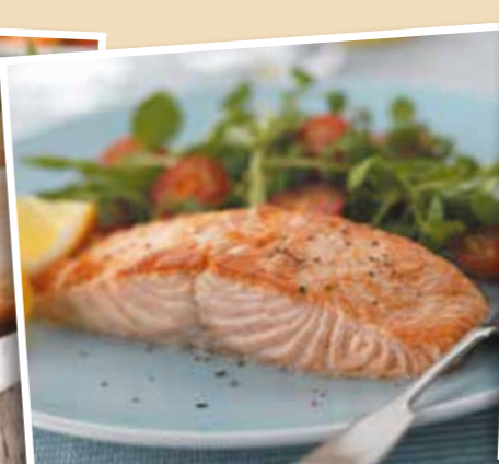
Seafood Selection – pages 14-15