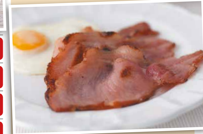
Unsmoked Back Bacon Sliced* 454g (1lb)