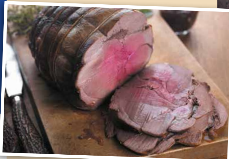
Scottish Wild Venison Haunch Boneless 1.36kg (3lb) WAS £35.29