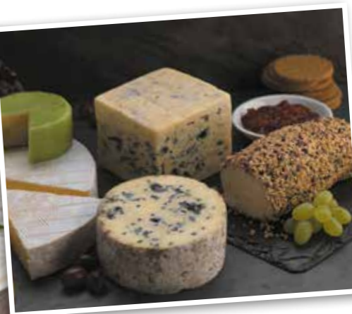
Deli Selection – page 21