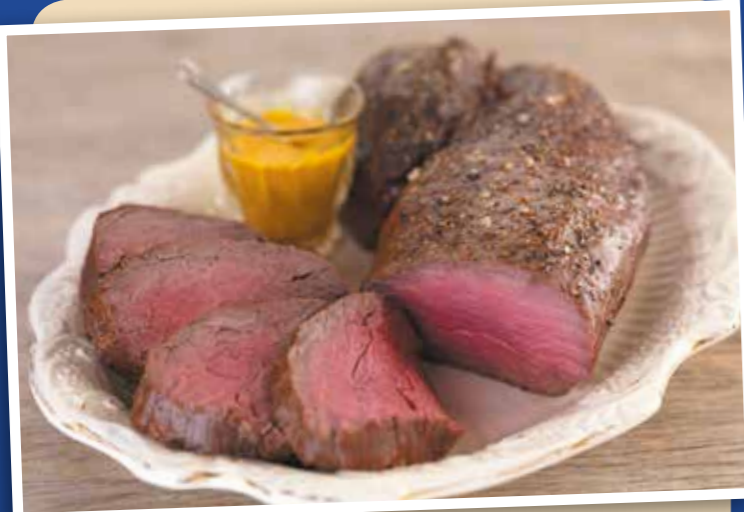
Scotch Beef Whole Fillet 907g (2lb) Serves 4 WAS £61.77