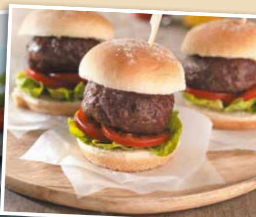
Burgers and Sausages – pages 16-17