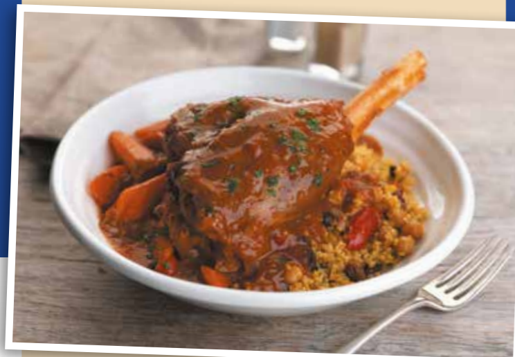
Scotch Lamb Shank 340g (12oz) Serves 1 WAS £5.08