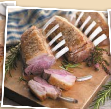
Scotch Lamb – pages 8-9