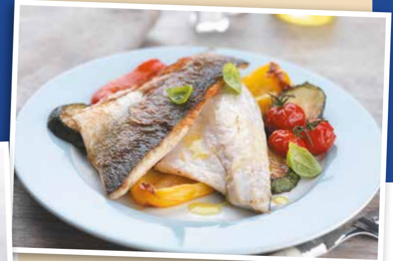
Sea Bass Fillet* 113g (4oz)