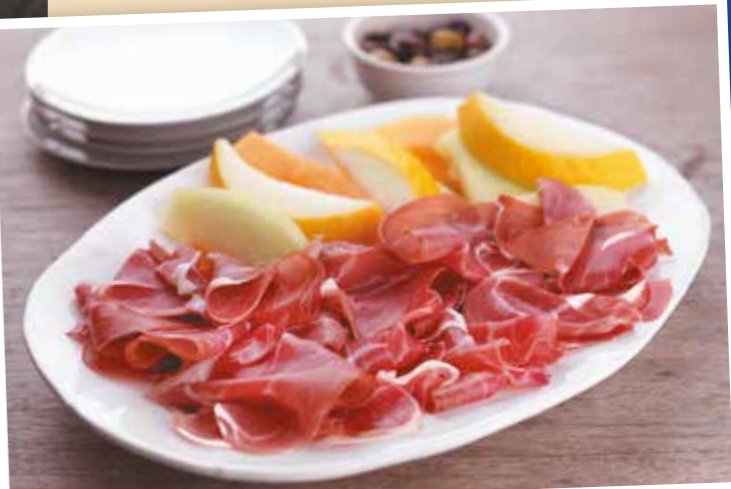
Prosciutto Crudo di Parma* 500g (17.6oz)