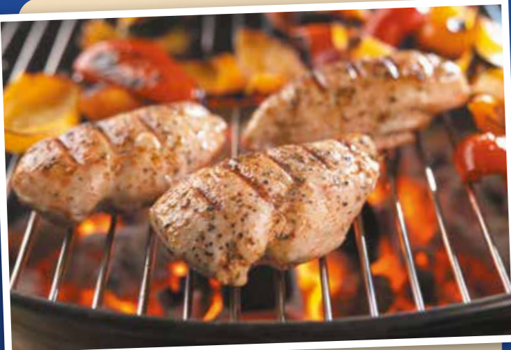
Chicken Breast Fillets* 10 Pack (7-8oz each) 1.98kg (4.4lb) WAS £18.50