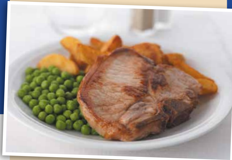
Scotch Pork Chop 170g (6oz) Serves 1