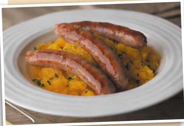
Rare Breed Pork Sausage 454g (1lb) WAS £5.77