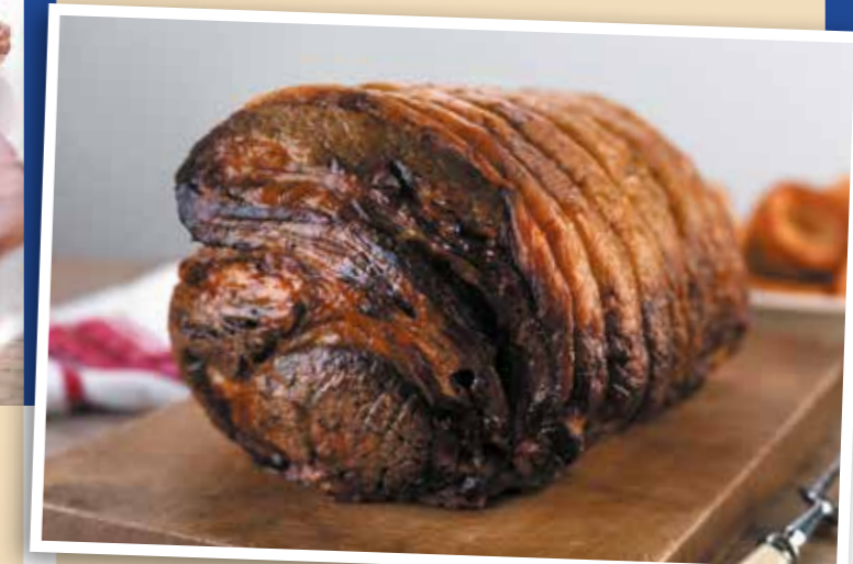
Scotch Beef Rib of Beef Boneless 1.81kg (4lb) Serves 8-9