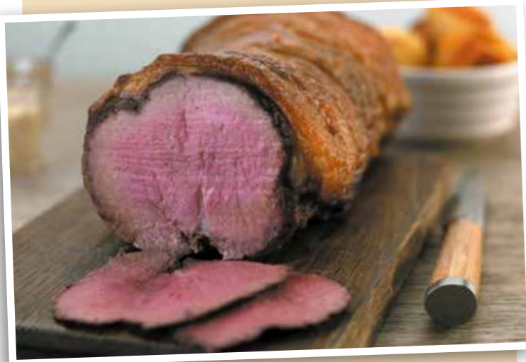
Scotch Beef Sirloin Roasting Joint 907g (2lb) Serves 4 WAS £31.70