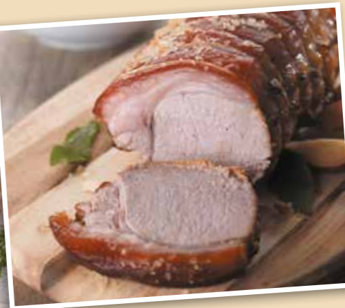
Specially Selected Pork – pages 10-11