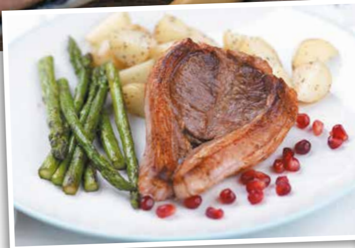
Scotch Lamb Valentine Steak (Above) 113g (4oz) WAS £4.85