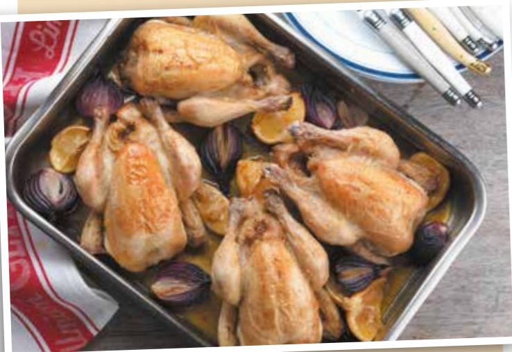
Poussin* 397g (14oz)