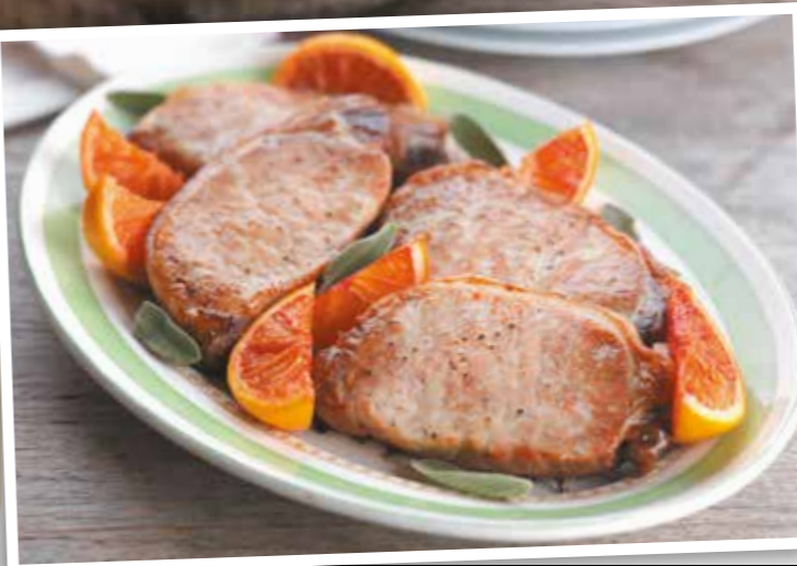
Scotch Pork Loin Steak (Above) 142g (5oz)