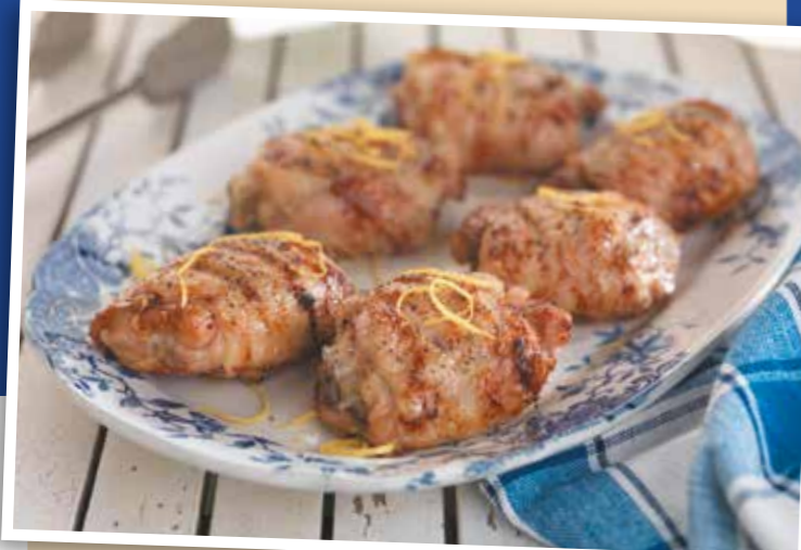
Chicken Thigh Bone In* 130g (4.6oz) WAS £0.80