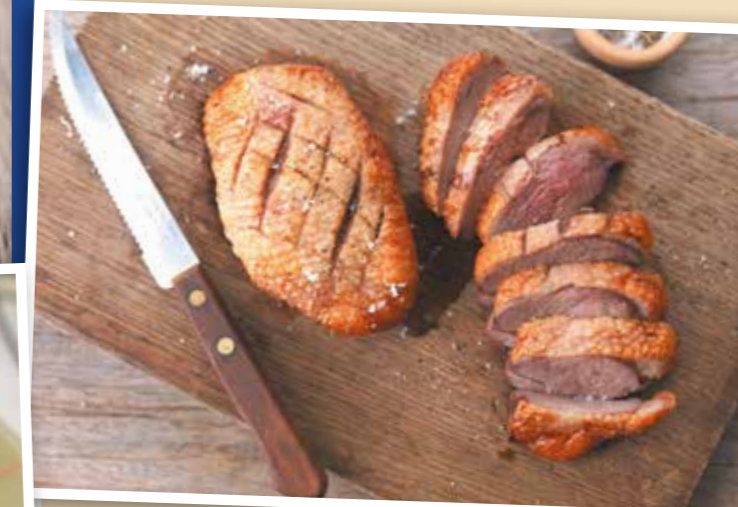
Barbary Duck Breast Female* 397g (14oz) Serves 2