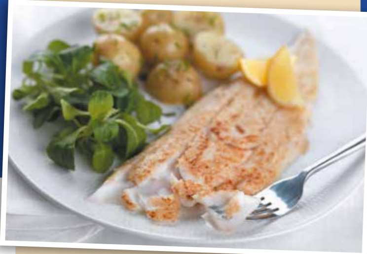
Haddock Fillet 227g (8oz) WAS £4.20