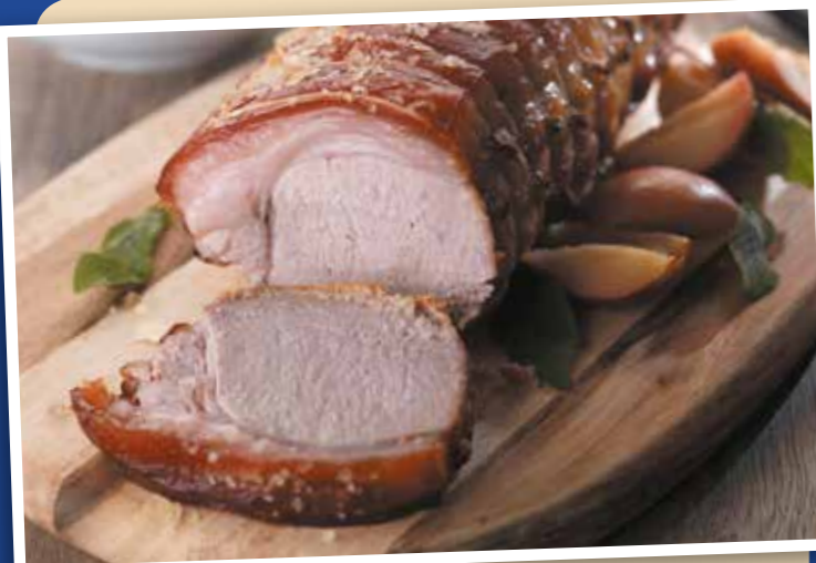
Scotch Pork Loin Boneless 907g (2lb) Serves 4