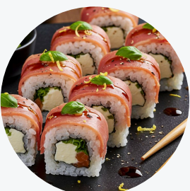
Double Tuna (raw)

Double Salmon maki with salmon on the top rolled in sushi rice and seaweed.