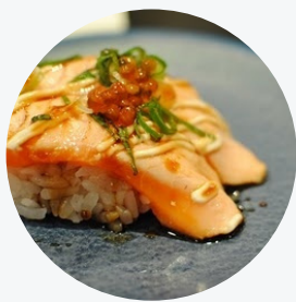
Seared Samon Nigiri