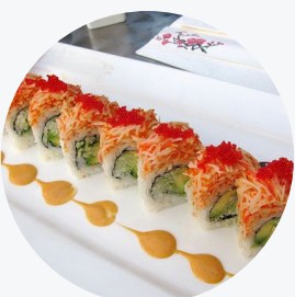
Crazy California (cooked)

Double Tuna maki, cream cheese, cucumber with tuna on the top rolled in sushi rice and seaweed.