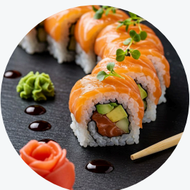
Cheese Double Salmon (raw)

California maki with salmon, tuna, and avocado on the top rolled in sushi rice and seaweed.