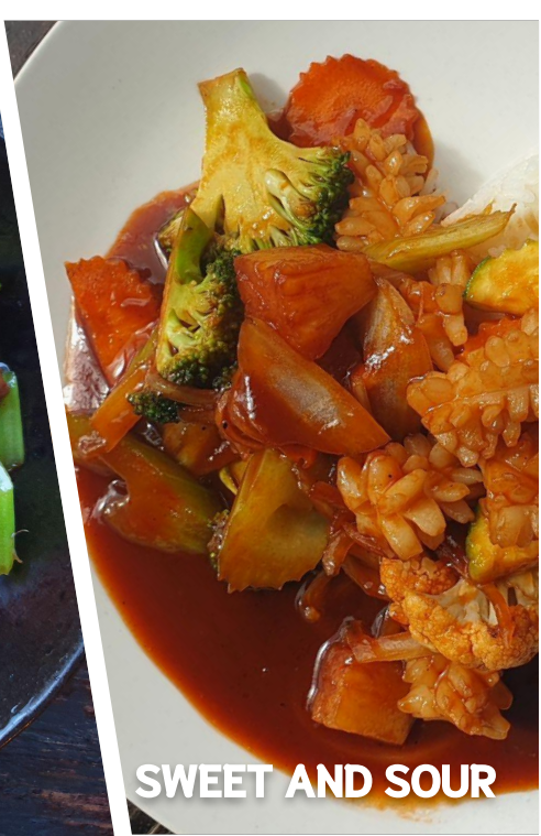
SWEET AND SOUR