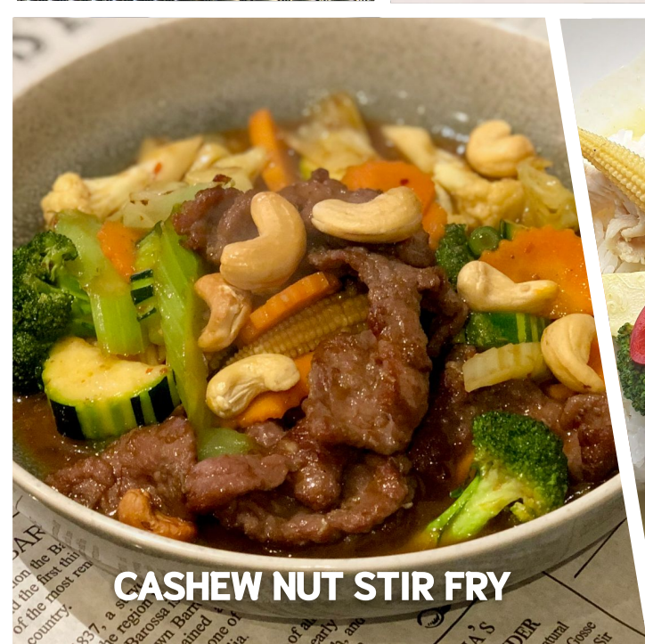
CASHEW NUT STIR FRY