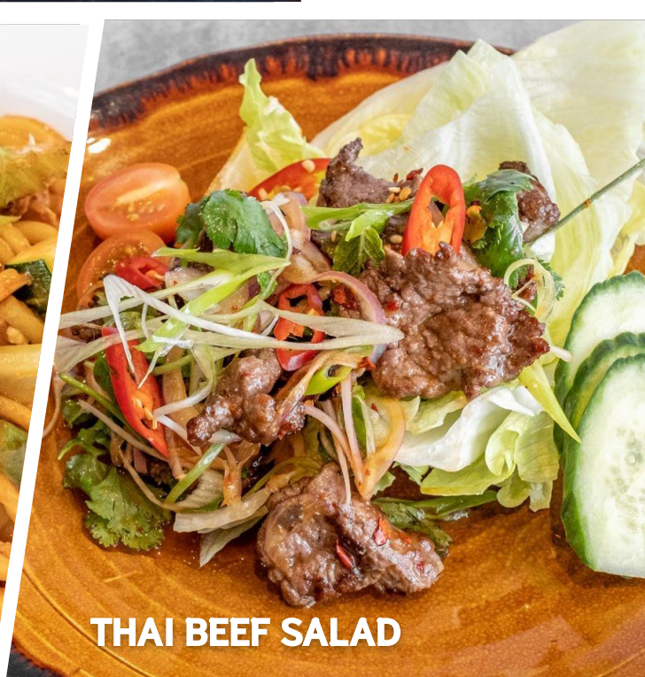
THAI BEEF SALAD