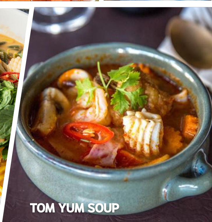
TOM YUM SOUP