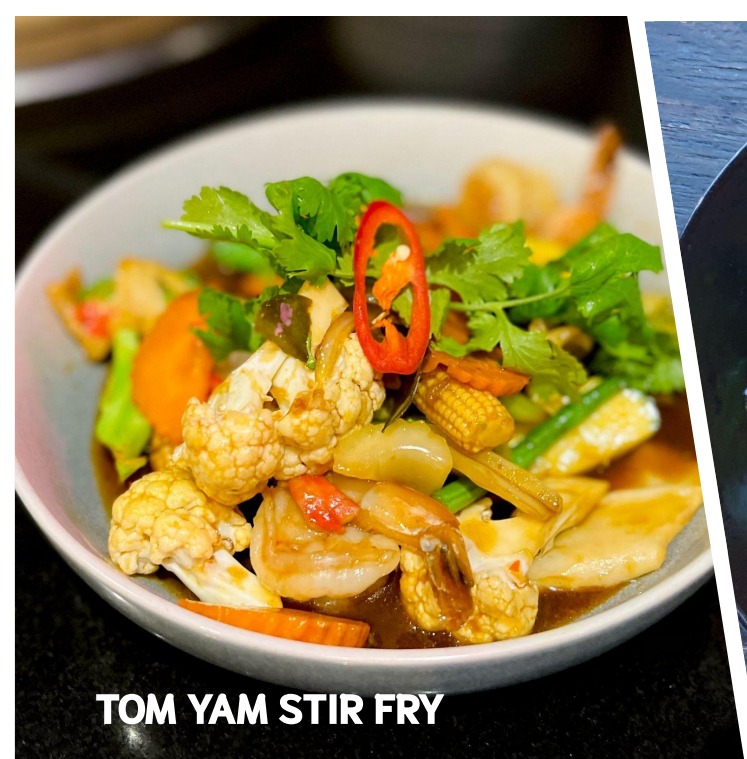
TOM YAM STIR FRY