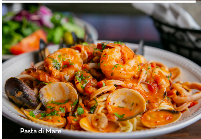
Pasta di Mare