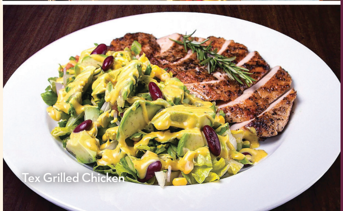
Tex Grilled Chicken

All prices are in UAE Dirhams inclusive of VAT