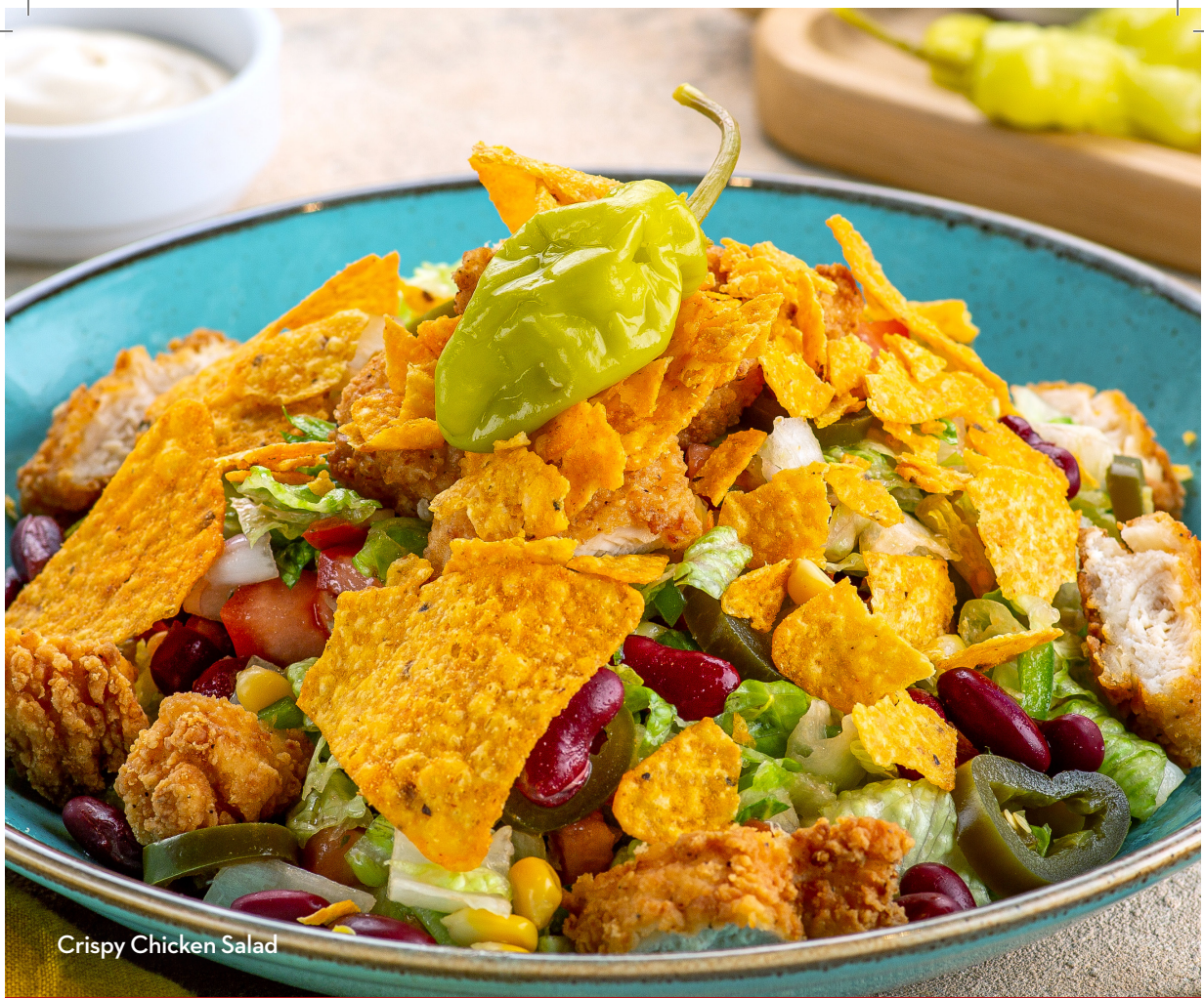
Crispy Chicken Salad

Russo's salad dressings are hand-prepared fresh daily and are MADE WITH AWARD-WINNING D.O.P. SICILIAN EXTRA-VIRGIN OLIVE OIL and the freshest premium ingredients.