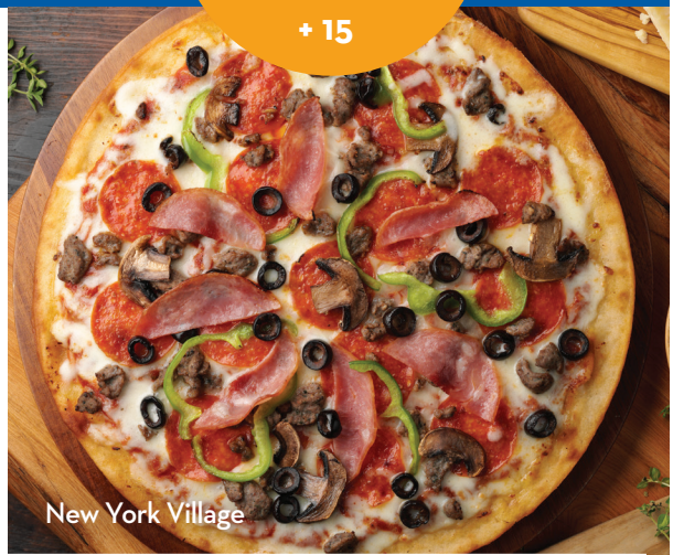
New York Village

All prices are in UAE Dirhams inclusive of VAT