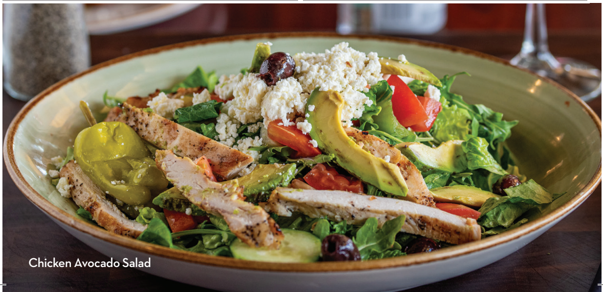
Chicken Avocado Salad