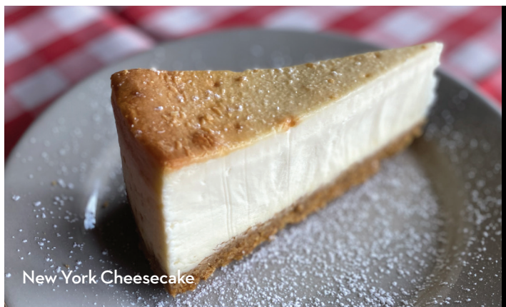
New York Cheesecake

Folded and baked calzone stuffed with Nutella chocolate and ricotta cheese. 35