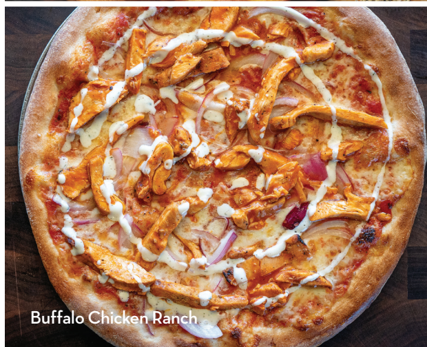
Buffalo Chicken Ranch