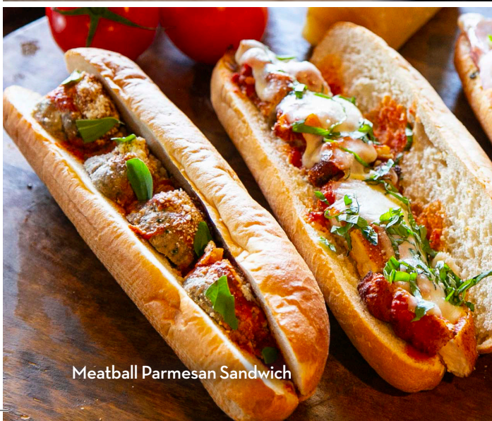
Meatball Parmesan Sandwich

Chicken sautéed with fresh spinach, Portobello mushrooms, garlic extra-virgin olive oil, and Wisconsin mozzarella cheese. 55