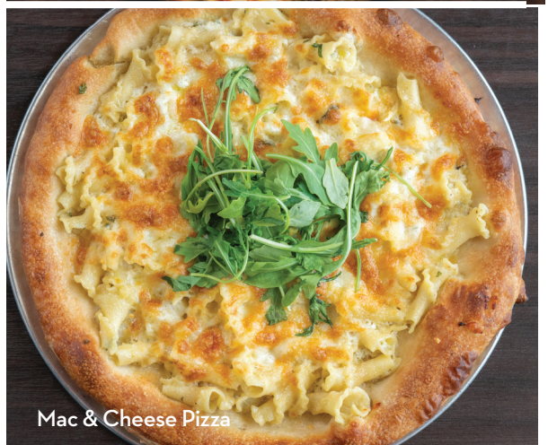
Mac & Cheese Pizza