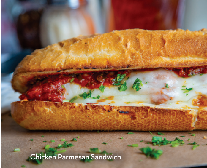
Chicken Parmesan Sandwich