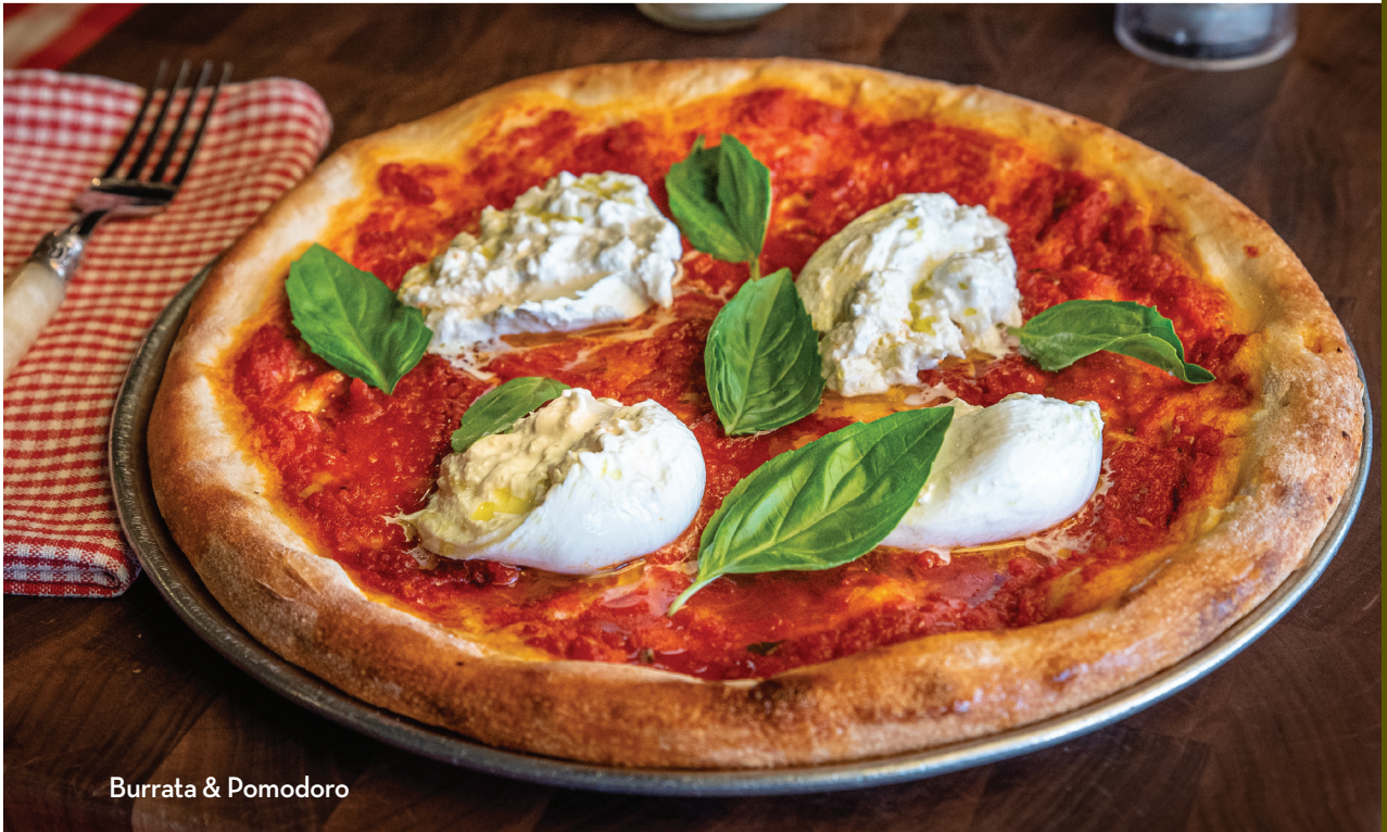
Burrata & Pomodoro