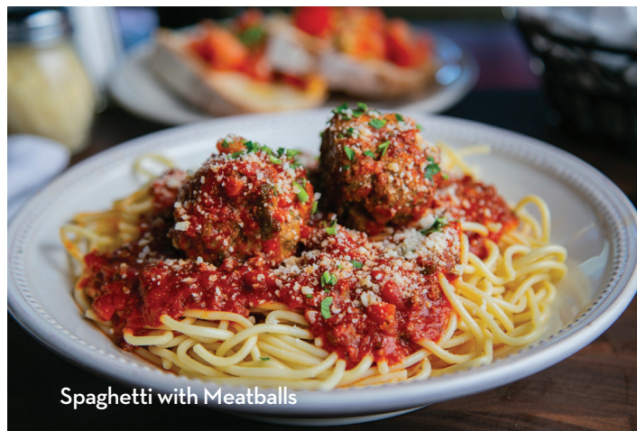
Spaghetti with Meatballs

All prices are in UAE Dirhams inclusive of VAT