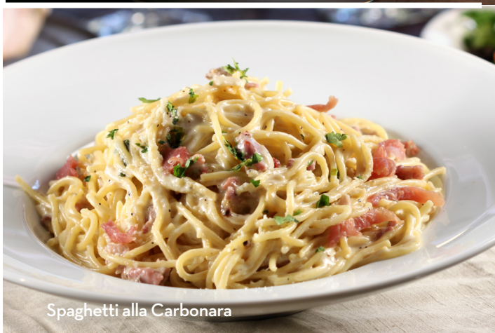
Spaghetti alla Carbonara