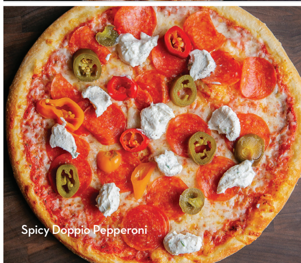
Spicy Doppio Pepperoni