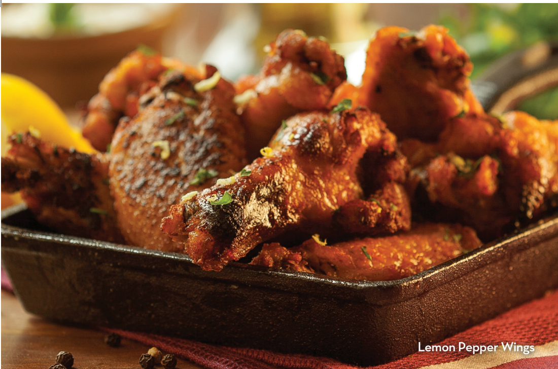
Lemon Pepper Wings