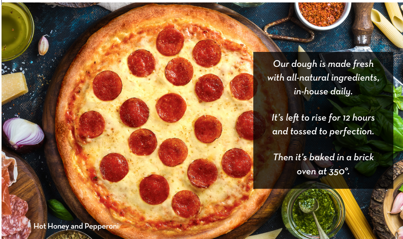
Hot Honey and Pepperoni

Our dough is made fresh with all-natural ingredients, in-house daily. It's left to rise for 12 hours and tossed to perfection. Then it's baked in a brick oven at 350°.