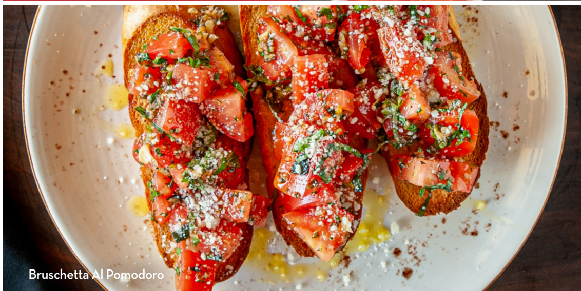
Bruschetta Al Pomodoro